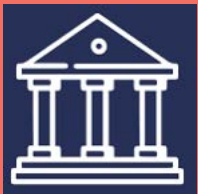
Lean Competitive Services