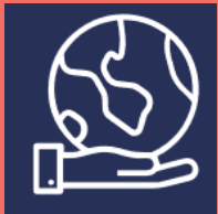
Global Business Services