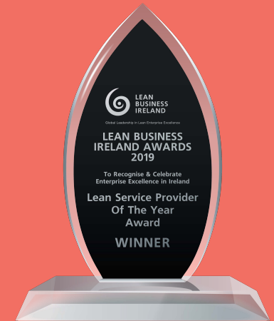
Winner of 2019 Lean Service Provider of the Year (Services Sector)