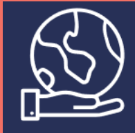
Global Business Services