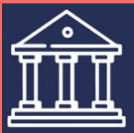
Lean Competitive Services